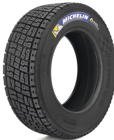
17/65-15 LTX Force T XL 90